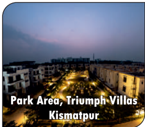
Park Area, Triumph Villas Kismatpur

Our commitment to quality is paramount. We strive to deliver products & services that consistently meet and exceed customer expectations, fostering their trust & satisfaction. We maintain stringent national & international standards throughout our supply chain for achieving continual improvement in our quality management system.