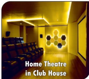
Home Theatre in Club House