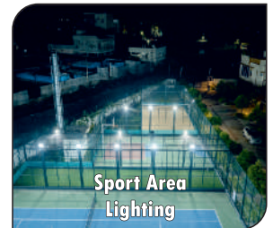
Sport Area Lighting