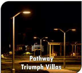
Pathway Triumph Villas