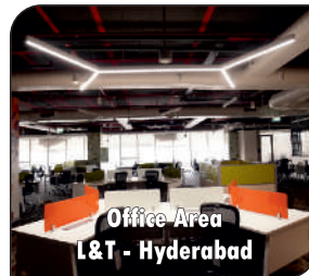
Office Area L&T - Hyderabad