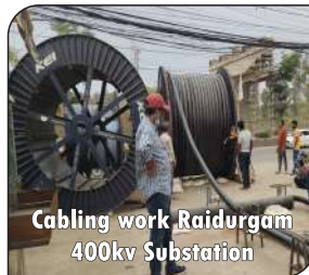
Cabling work Raidurgam 400kv Substation