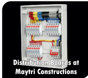
Distribution Boards at Maytri Constructions