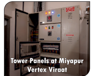
Tower Panels at Miyapur Vertex Viraat